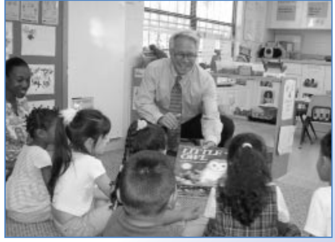
"This is a program that I look forward to every year. Going to the schools and meeting the children is a wonderful way to reinforce the importance of reading and education."