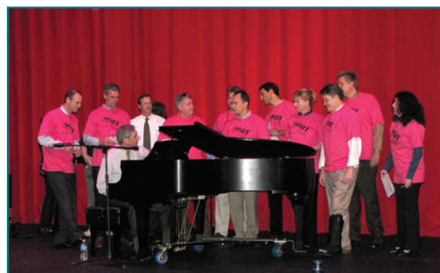
North County Section's Board of Directors sing "Piano Man" for tips (good thing they have day jobs!)