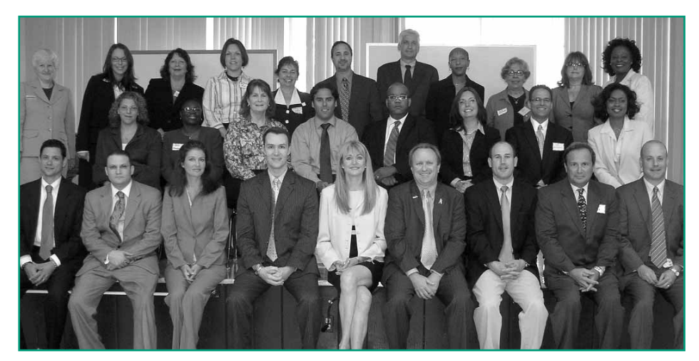
Members of the Palm Beach County Bar Association volunteered for International Literacy Day at the Adult Education Center in West Palm Beach (pictured with the principal of the school as well as the Executive Director for the Palm Beach County Literacy Coalition).