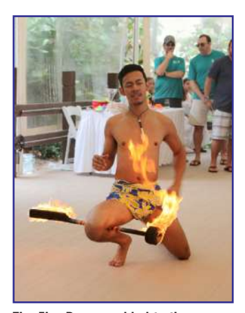
The Fire Dancer added to the excitement of the afternoon