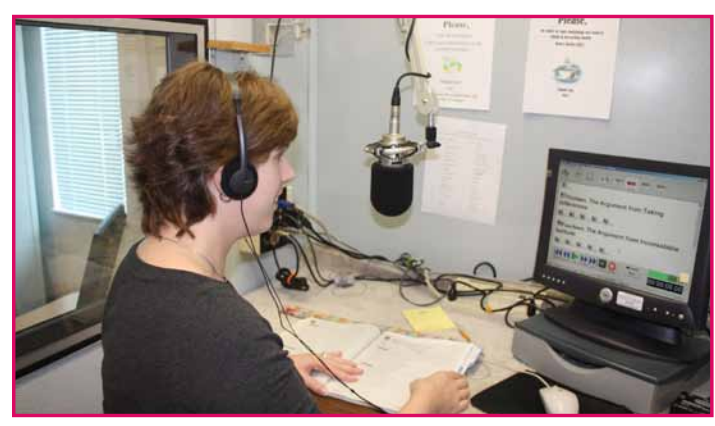
Peggy Wood reading on tape during a Bar event in 2010

Please RSVP by contacting Rita at Rita@ markgreenberglaw.com. We will need your name, cell phone, work phone, and e-mail address.