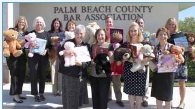
Members of our Lawyers for Literacy Committee show their support for National Adoption Day by hosting its second annual book and bear drive. Thank you to all of our members who donated books, bears and money.