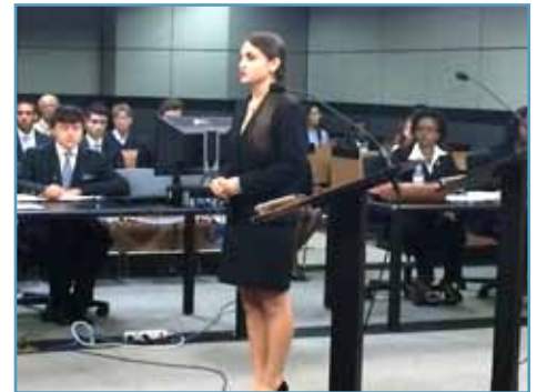
Student from American Heritage presents opening argument to a panel of judges

The Law Related Education Committee has additional events scheduled as well, including Benchmarks programs "Judge for Yourself" at the