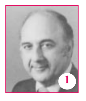
Answers on page 12

In continuing with a project started by last year's Historical Committee, we will continue to run old photos of some of our members. Can you guess who they are?