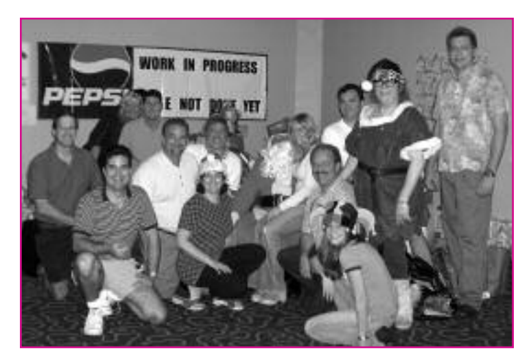
Board members, along with support from community elves, help Santa prepare for the arrival of hundreds of children.

The North County Section recently sponsored their annual holiday party for more than 200 children in the Guardian ad Litem program. These children have been abused or neglected and are involved in the Palm Beach County court system. Many thanks go to our hard working Board of Directors for arranging the afternoon of bowling, lunch and presents.