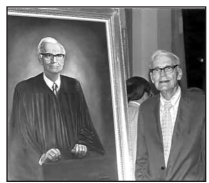
Judge Joseph White