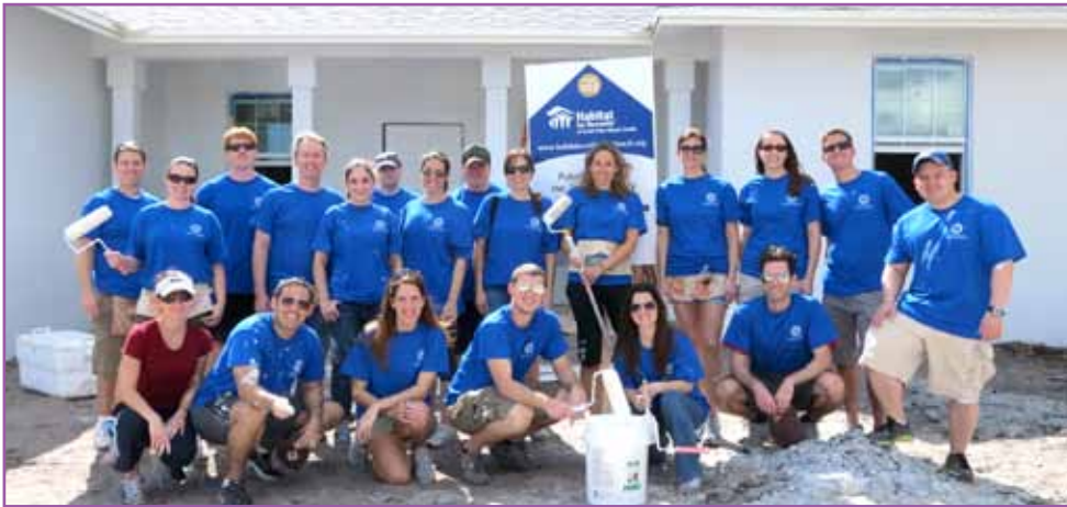
Members of the Young Lawyers Section recently volunteered their Saturday morning working on the Section's third Habitat project.