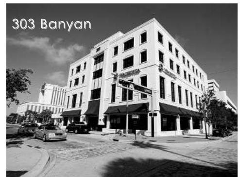
303 Banyan Blvd. | West Palm Beach, FL 33401