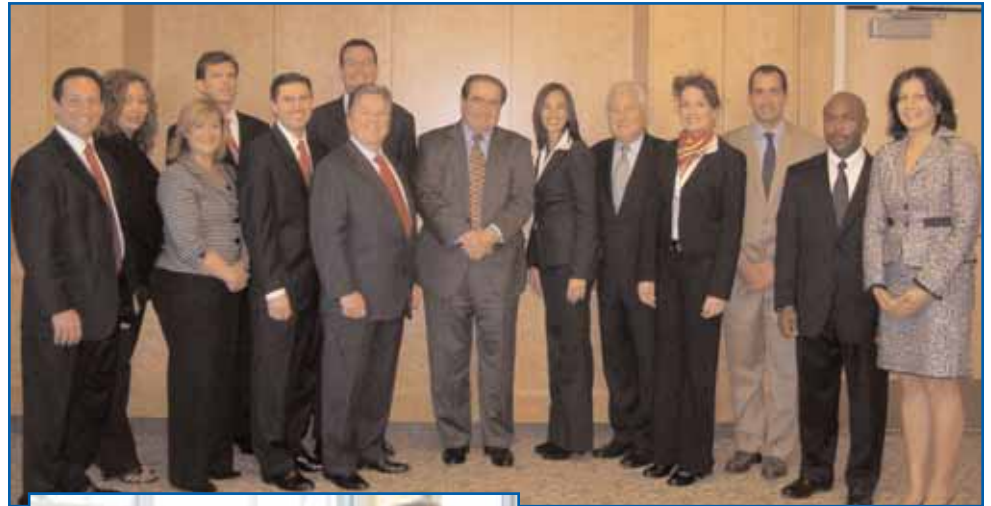
United States Supreme Court Justice Antonin Scalia pictured with our Board of Directors before addressing more than 700 at the Kravis Center.